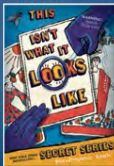
This Isn't What It Looks Like 978-0-316-07624-1