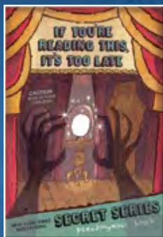
If You're Reading This, It's Too Late 978-0-316-11368-7