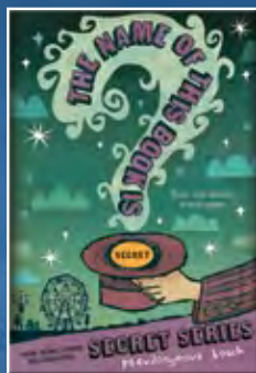
The Name of This Book Is Secret 978-0-316-11369-4

Before THE BAD BOOKS , Pseudonymous Bosch Had a SECRET...