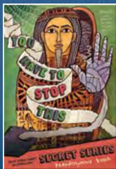
You Have To Stop This 978-0-316-07627-2