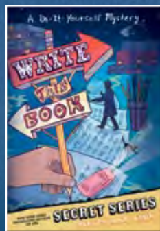
Write This Book: A Do-It-Yourself Mystery 978-0-316-20780-5