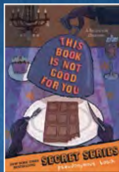
This Book Is Not Good For You 978-0-316-04085-3